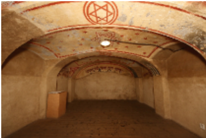
The prayer room