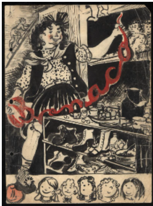
Cover of Bonako magazine