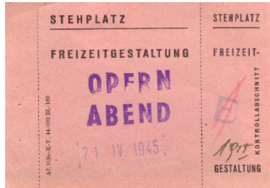
Opera ticket from Terezin

The paradox of Terezin was that on the one hand people were dying of hunger, desperation, dirt, disease, hopelessness, but on the other hand people played soccer, there were concerts, operas such as Brundibar, The Bartered Bride, and so on. In Terezin people sang, people died. And you have to put that together.