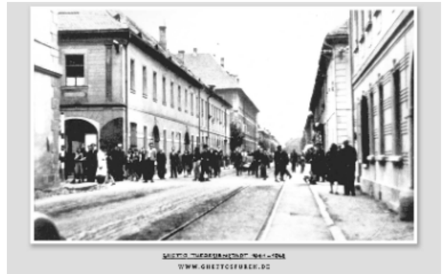
Train tracks in the Theresienstadt ghetto