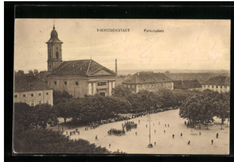
Marktplatz before the establishment of the ghetto

When my work in the children's home ended where I was 'Betreuer' (guardian) I was assigned to war production. In Terezin, the Germans erected a large tent on the Marktplatz and that's where we had to work. We manufactured car motor heaters there. When their vehicles froze up in Russia they had to think of some solution, so they came up with these gas heaters that heated up the motor from below without damaging it, and the vehicles could continue on. Each enterprise, in the wider sense of the word, such as a kitchen or our children's home, was required to assign a couple of people to war production. I was the youngest of the 'Betreuer,' so it fell to me. I worked in the heater plant during my last month in Terezin. People that worked here in that German Wehrmacht factory were automatically exempt from transports. But various tricks and frauds were perpetrated – whoever had the means pulled his friend from the transport and stuck someone else in their place, like perhaps someone working in war production.