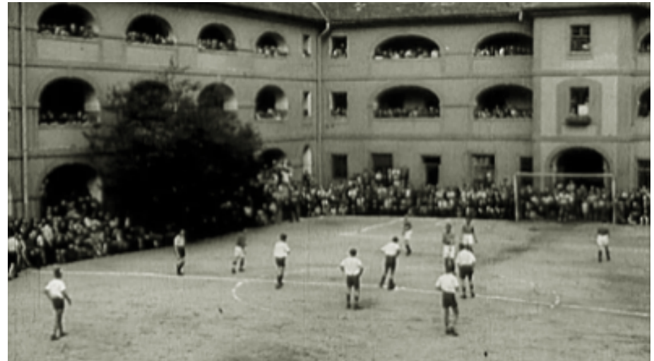
Football game at the Dresden barracks

You know, the teachers in L 417 were always trying to distract us from everyday ghetto life, from the everyday horrors of that prison. They tried, within the realm of possibility, to give us some sort of normal living conditions. We competed in football; each home had its own football team. We played on some sort of field that had been built on the fortress walls. Of course, the grown-ups also played football in the courtyard of the Dresden barracks. That was always a big event. Several hundred, perhaps a thousand people would gather around and cheer for the individual teams.