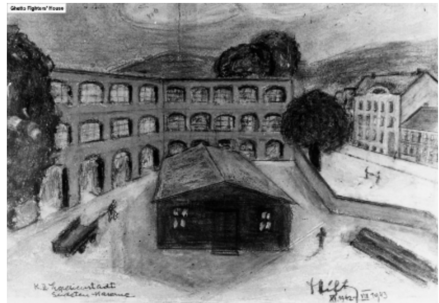
Drawing of the "Sudeten Barracks" on the grounds of the Terezin (Theresienstadt) ghetto

By 1942, all the original inhabitants of Terezin had been moved out and the entire town had opened up. Jews moved in and occupied all the houses, and the transports kept coming. At that time, young peoples' homes were also being set up. The girls' home 'L410' was situated next to the church. It was a three-story building, and the girls were put in separate rooms according to their age. We older children went to work during the day and when we got back we were attended to by a tutor. At first I was in room 29, where the tutor was Rozi Schulhofova. Plenty of interesting people, including professors, writers, and musicians came to see us to give talks or to discuss different topics. My brother lived in the Sudeten Barracks with the men. At first we weren't at all allowed to go there since we couldn't leave our barracks without a pass. After a certain period of time, it was arranged that girls under 14 could go to the men's barracks once a fortnight, provided they were accompanied, so as to see their dads. I was 14 and actually didn't belong to that group, but my mom somehow always managed to push me through, so I was able to see my brother. Now and again, I would bring him the odd button and such, or I would stroll around the courtyard with my friend Jirka.